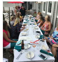
The SC-Lowcountry Sustainer Boards for 2016-17 and for 2017-18 enjoying lunch at the Leamington Beach House at their combined May Board Meeting