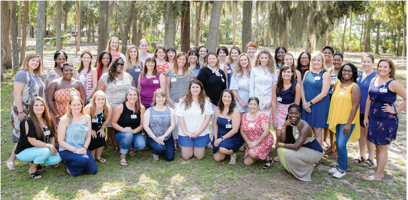
SAVANNAH AND SOUTH CAROLINA LOWCOUNTRY PROVISIONALS WITH THEIR ADVISORS.