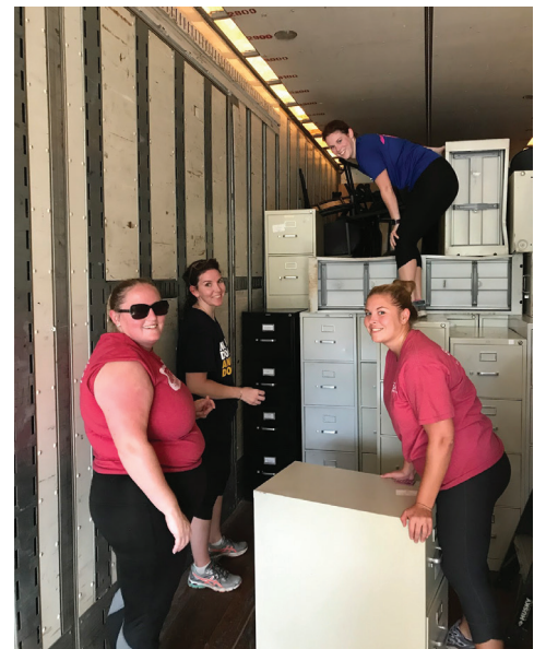
File under hard work!