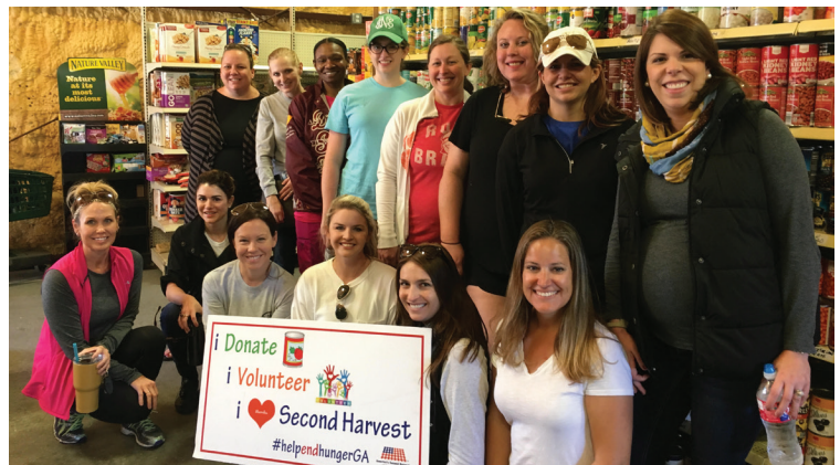
Golden Isles members participate in a brown bag loading event at the America's Second Harvest of Glynn Count to load bags of groceries for the community's hungry, setting a record for the highest number of bags loaded in a morning session!