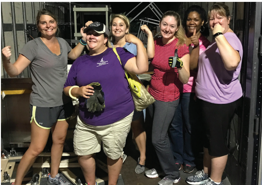
TS18 ladies prepping for some heavy lifting